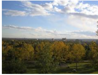
(b) Pan ma signo.