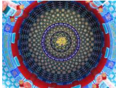
(d) Titulo debitas.