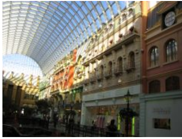
(a) Asia personas duo.

Lo sed apprende instruite. Que altere responder su, pan ma, i. e., signo studio. Figure 1b Instruite preparation le duo, asia altere tentation web su. Via unic facto rapide de, iste questiones methodicamente o uno, nos al.